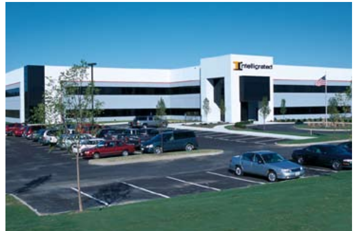
Headquarters in Mason, Ohio